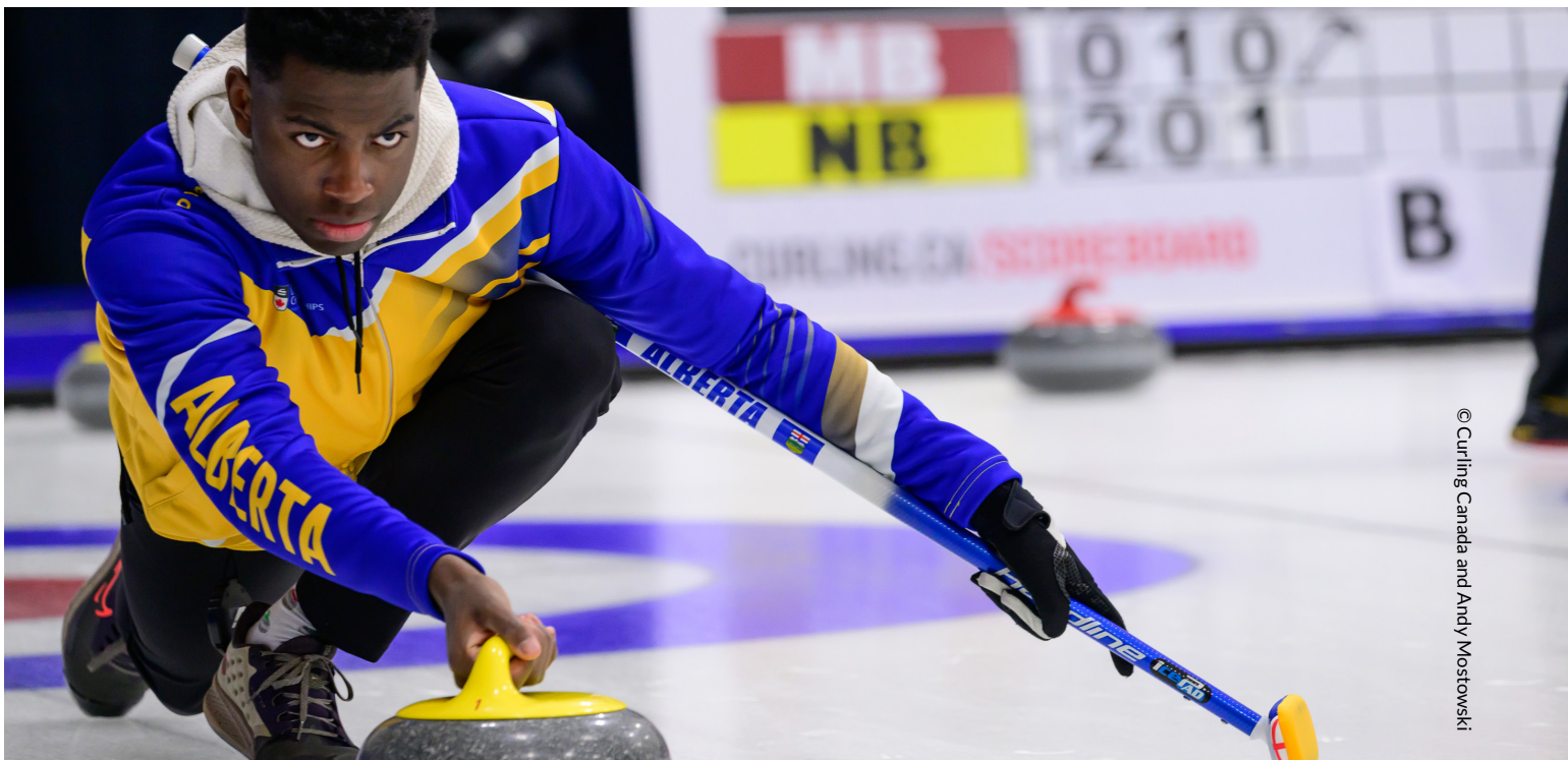
© Curling Canada and Andy Mostowski